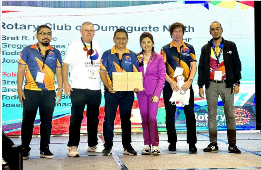
Congratulations to all RCDN Rotarians and Spouses!!!